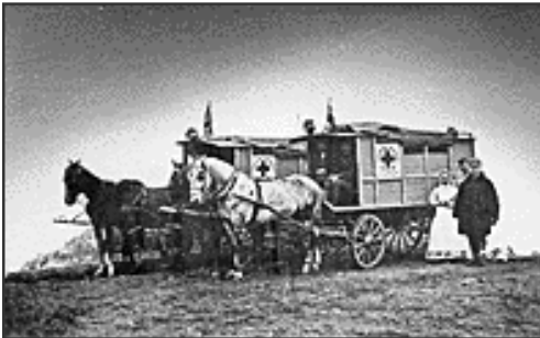
Serbian-Turkish War, 1878. Serbian ambulance.

The first half-century of the ICRC's existence saw the development of concerted and coordinated humanitarian action for war victims, on the basis of international law.