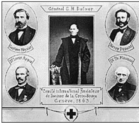
Members of the Committee of Five, which later became the ICRC.